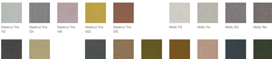
Steelcut Trio 113 | Steelcut Trio 124 | Steelcut Trio 416 | Steelcut Trio 453 | Steelcut Trio 515 | Molly 112 | Molly 114 | Molly 152 | Molly 194 | Canvas 154 | Canvas 414 | Remix 173 | Remix 252 | Remix 412 | Remix 422 | Remix 612 | Remix 873 | Remix 982

G1: Remix | G2: Molly, Canvas | G3: Steelcut Trio