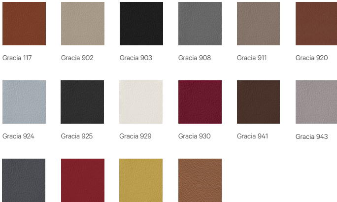
Gracia 117 | Gracia 902 | Gracia 903 | Gracia 908 | Gracia 911 | Gracia 920 | Gracia 924 | Gracia 925 | Gracia 929 | Gracia 930 | Gracia 941 | Gracia 943 | Gracia 944 | Gracia 945 | Gracia 950 | Gracia 967